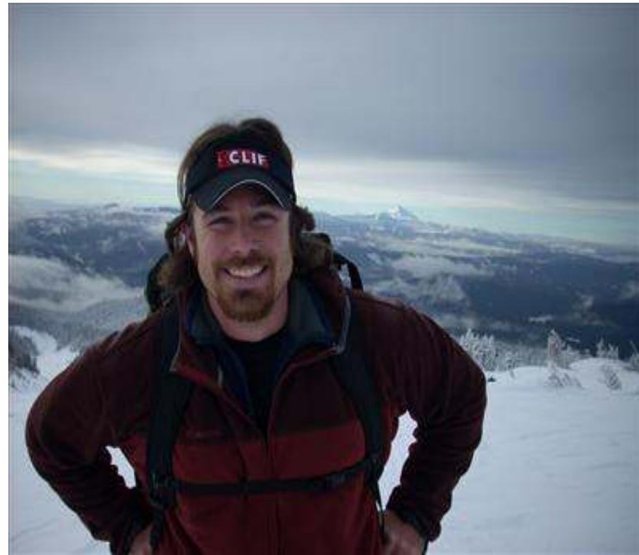
Photo: Capricorn, likes to ski and kayak

Masters in Public Management Direct Mail, Event planning, Grant writing and Board development Waterkeeper Alliance River Network International Relief Efforts